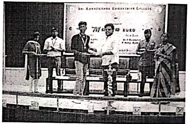
Valedictory Function (Prize Distribution)