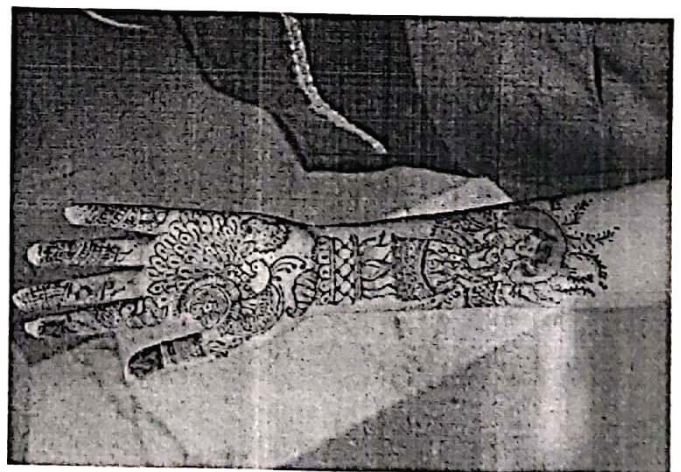
Mehandhi depicting Kashmiri culture